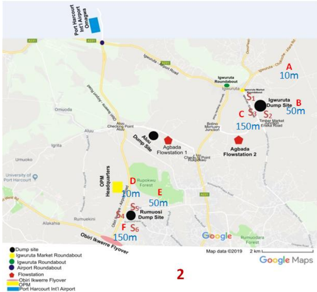
Fig. 2. Two un-engineered Dumpsites at Rumuosi and Igwuruta

Leachate samples were taken from the two waste dumpsites at 3 points each and a total of 6 points (S 1 , S 2 , S 3 , S 4 , S 5 , S 6 ) were sampled randomly. The samples of selected boreholes at station A, B and C were 10 m, 50 m and 150 m respectively away from the Rumuosi dumpsite and selected boreholes D, E and F at the same distances to Igwuruta dumpsite (see Fig. 2). Agbada2 borehole water as Control was at the distance of 9540 m from Rumuosi and 1350m from Igwuruta dumpsites. This is a drinking water source from an Oil-based flow station within the study areas.