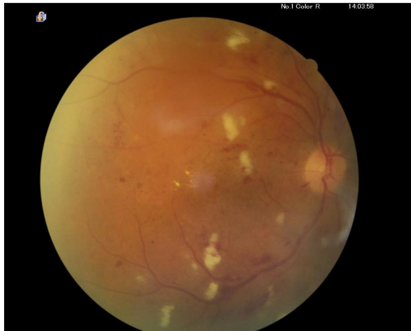
Fig. 2. Fundoscopy (Right eye) multiple cotton-wool spots and intraretinal hemorrhages

There is no consensus on treatment [11] and proposed treatments to restore retinal circulation in the acute phase of occlusion have not been proven efficacy [13]. Some authors propose high-dose intravenous corticosteroids [11], with accelerated visual recovery after use [10]. They inhibit leukocyte aggregation secondary to high-dose complement activation and are thought to play a neuroprotective role. However, at the time of diagnosis, the phenomena of leukocyte aggregation and ischemia are already in place and treatment would only have an impact on the reduction of retinal edema [11]. In the clinical case presented, the recovery of retinal lesions and acute pancreatitis was superposed, and anticoagulant treatment (heparin at hypo-coagulant doses) proved to be indispensable due to the various thrombophlebitis complicating pancreatitis. Anticoagulants can sometimes be combined with vasodilators or systemic corticosteroids. These corticosteroids are useful adjuvants for the reduction of necrotic inflammation could block granulocyte aggregation induced by the C5a fraction of complement [14]. However, their therapeutic use is controversial and more information is needed to determine whether or not corticosteroids may alter the natural history of a patient with Purtscher's pseudo retinopathy [10].