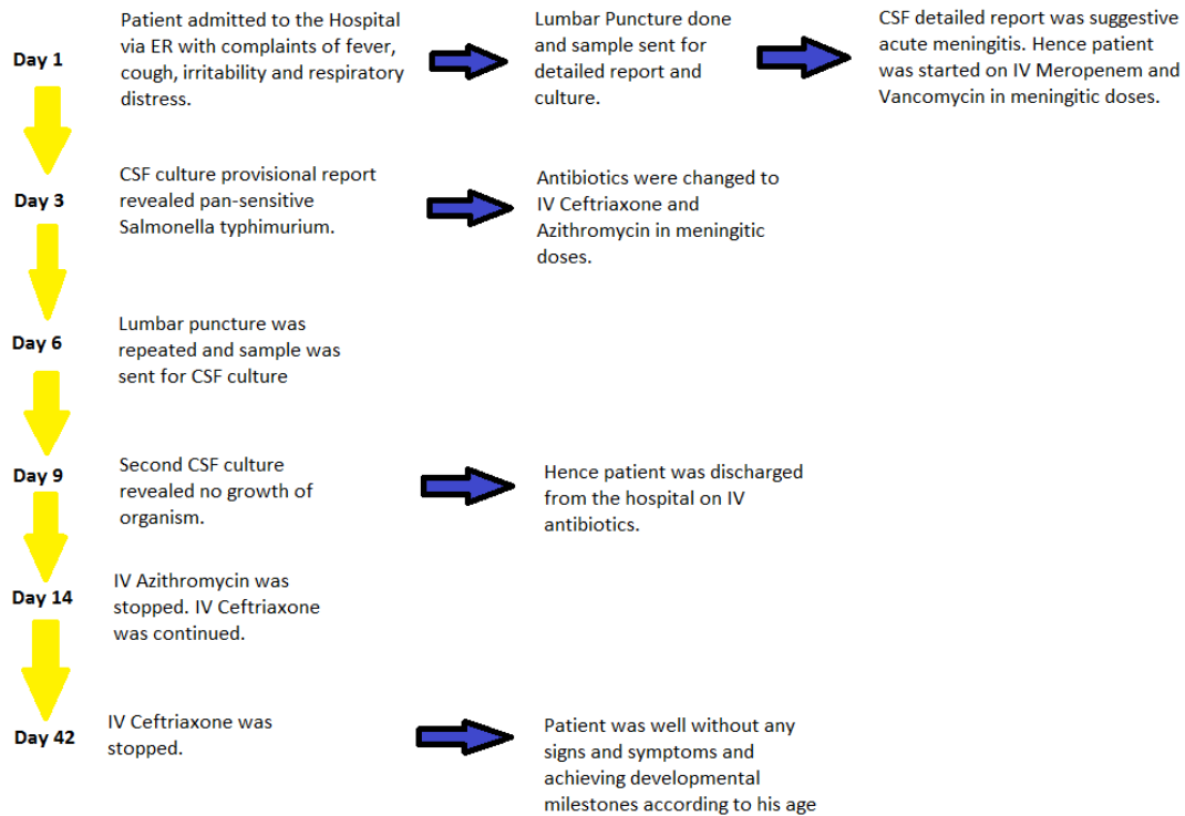
Fig. 3. Timeline depicting the main events in case

polymorphs, a decrease in protein count to 144 mg/dl and few pus cells. Sample was sent for culture and sensitivity which revealed no growth of organism. Patient remained afebrile, his symptoms improved, and he was discharged from hospital on intravenous ceftriaxone which was continued for a total of 42 days and oral azithromycin for a total of 14 days. He was followed up in clinic after 1 week and after 1 month of discharge and on both occasions he remained well without any signs and symptoms achieving developmental milestones according to his age and compliant to antibiotic therapy (Fig. 3).